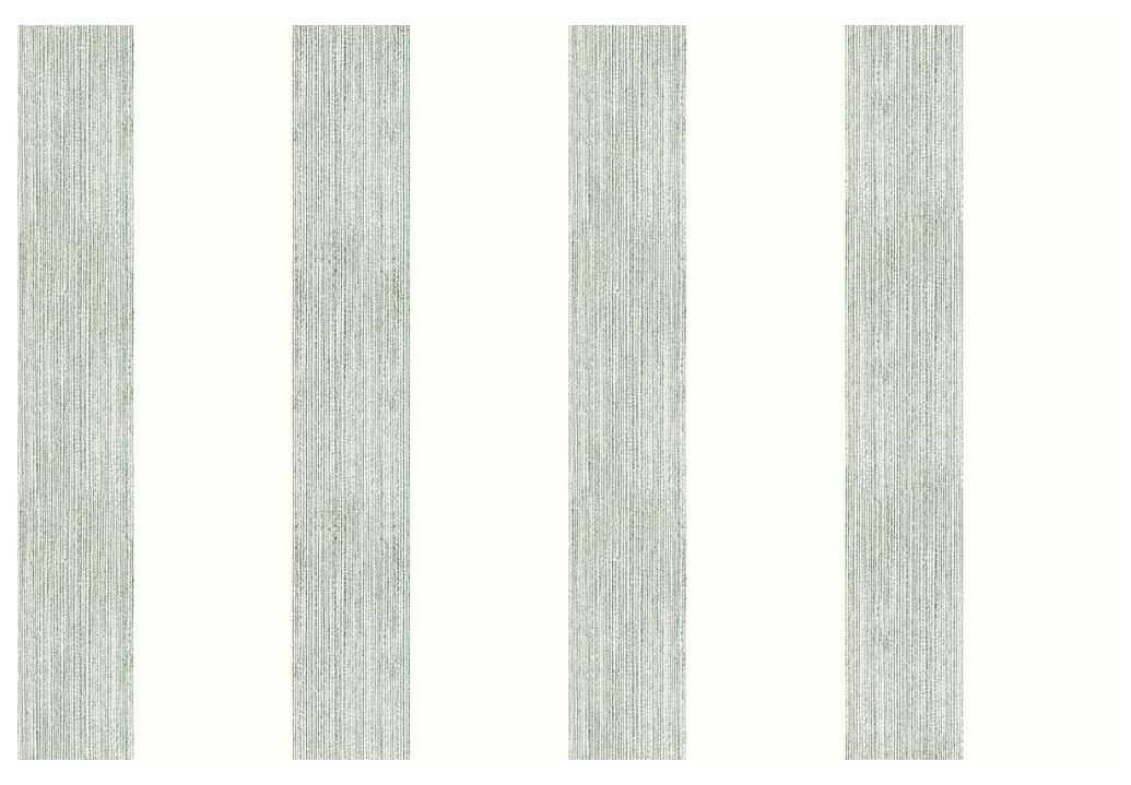
Brome Stripe Moss Wallpaper