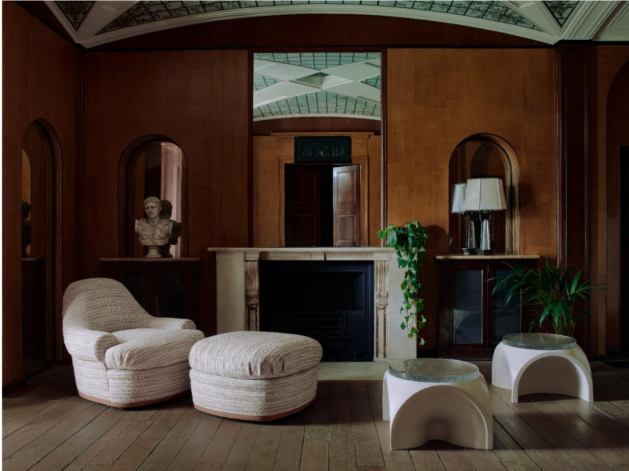
Wanderer Orange by And Objects