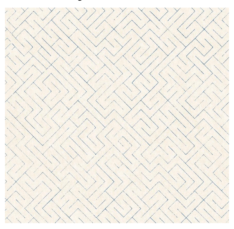
Triangulated Cobalt Wallpaper