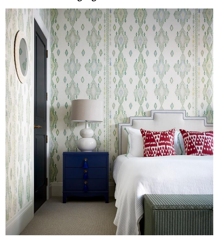
Travelling Light Grass Wallpaper, Interior design by Turner Pocock