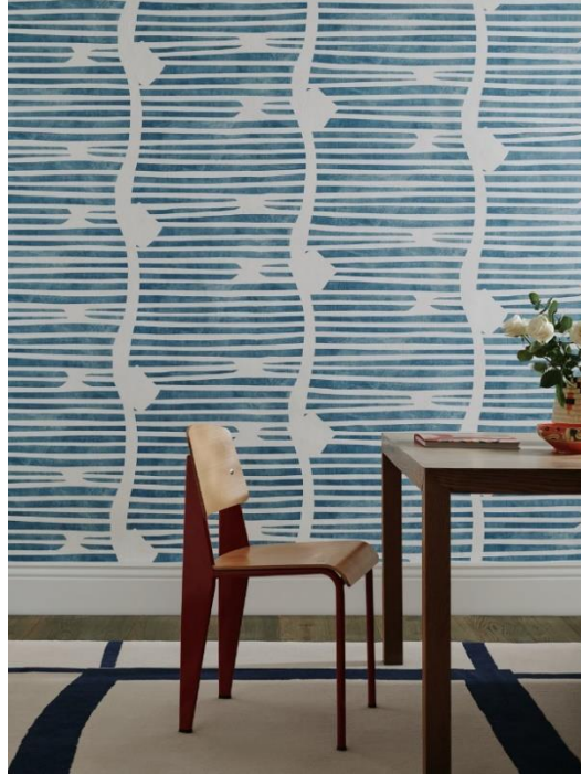
Shore Lines Cobalt Wallpaper