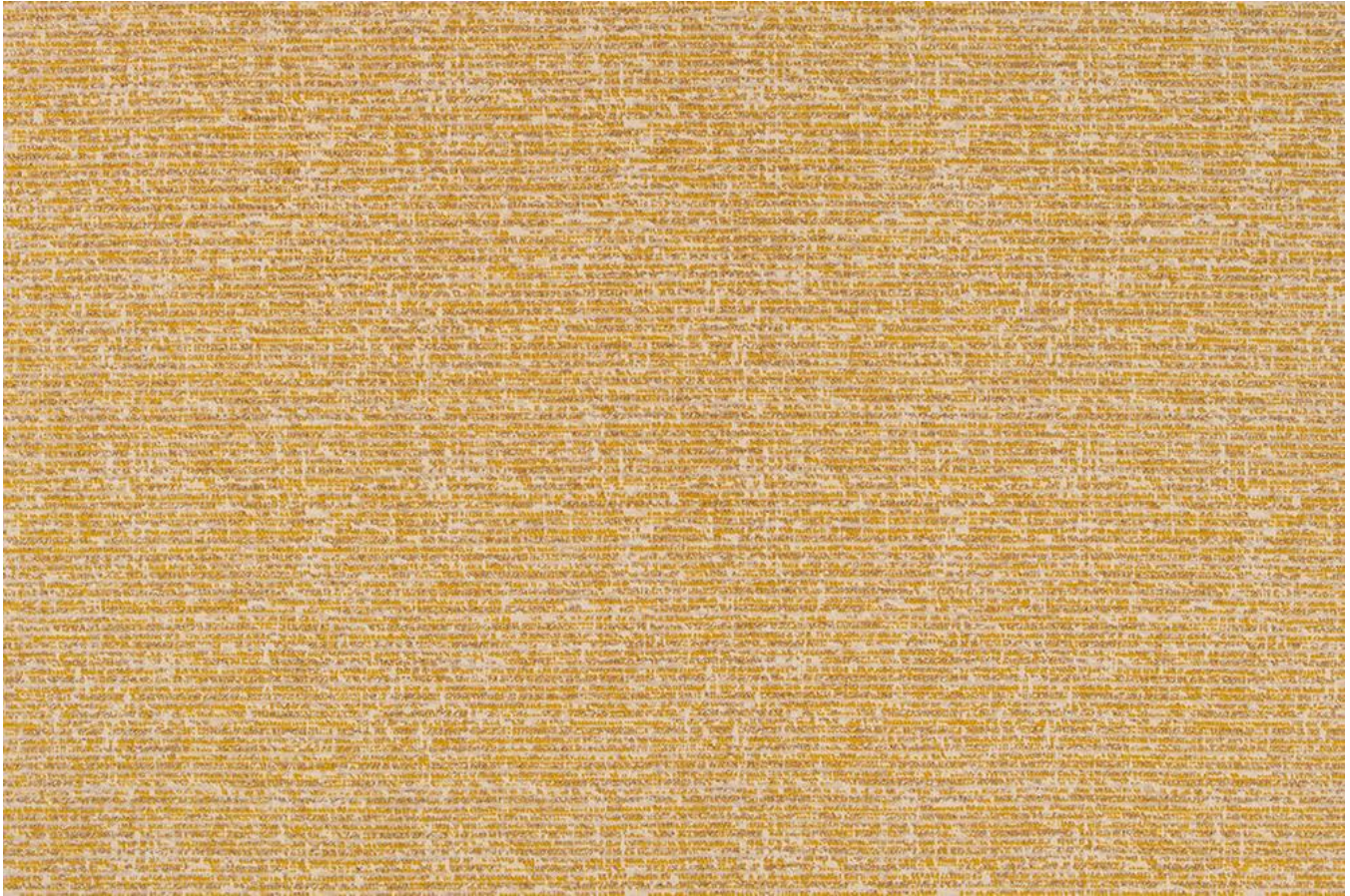
Ramble Lemon Fabric