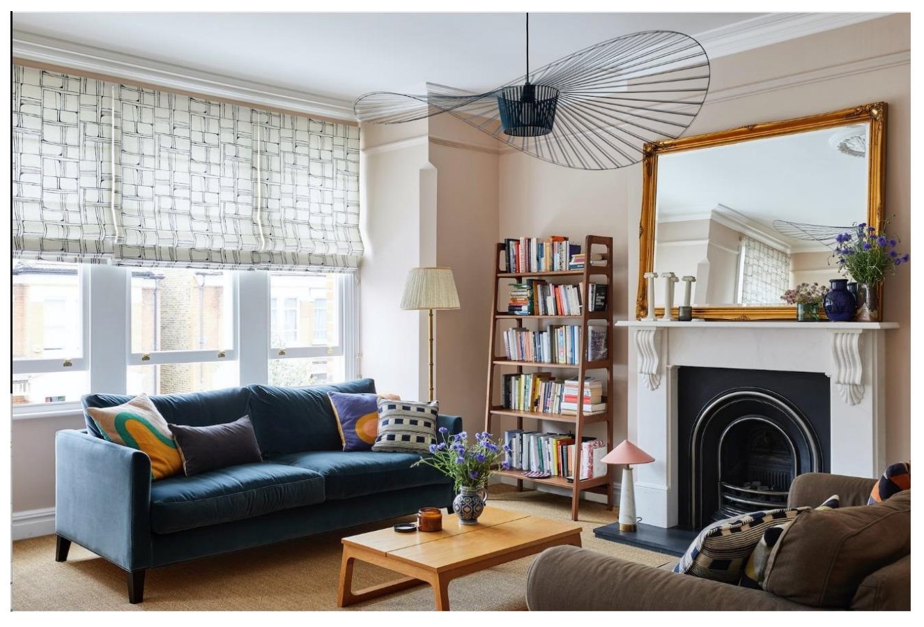
Quadrant Indigo linen, Interior Design by Imperfect Interiors