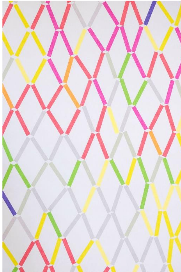
Porto Fuchsia Wallpaper