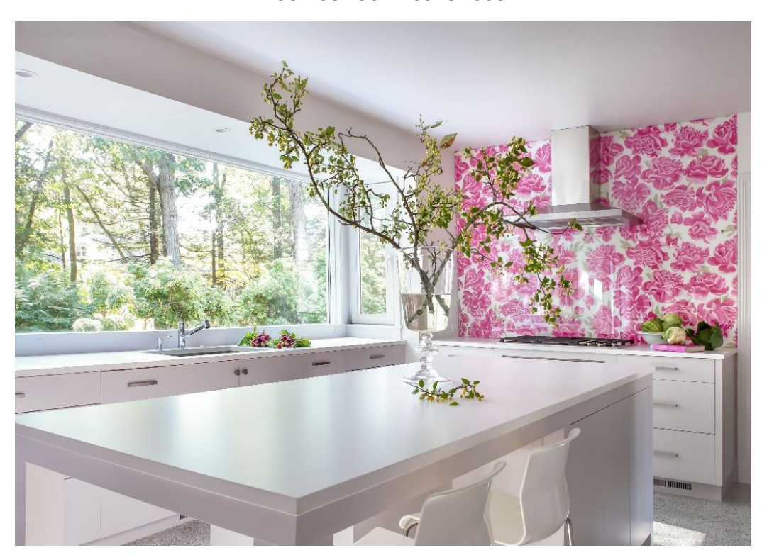
Peonies Fuchsia Wallpaper, Interiors Abby Yozell LLC