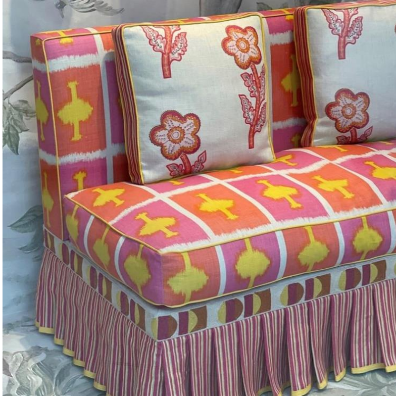
Ozone Lemon Linen Upholstery, Design by Kit Kemp