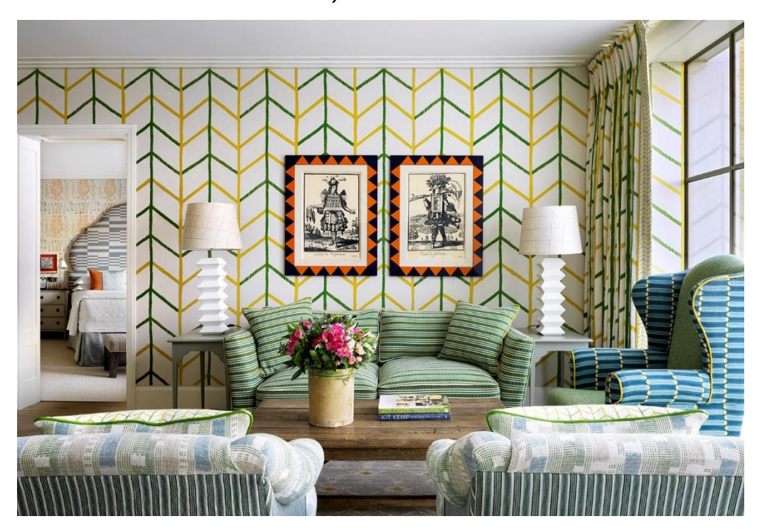
One Way Linen used as wallpaper, Interiors by Firmdale Hotels