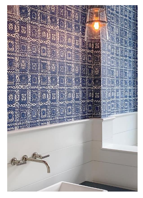
Mosaic Cobalt Wallpaper, Interiors by Pineapple Design Group