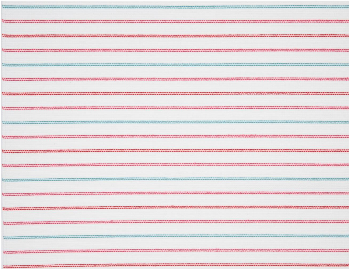
Miyake Rosa Outdoor Fabric