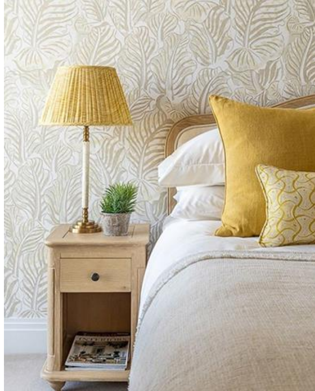
Mille Feuilles Slate Wallpaper, Interiors by Studio Hydrox