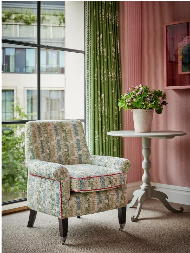
Loom Weave Green, Interiors by Kit Kemp