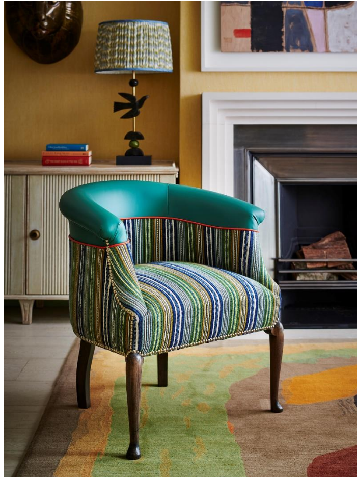
Live it Up Indigo Fabric by Kit Kemp