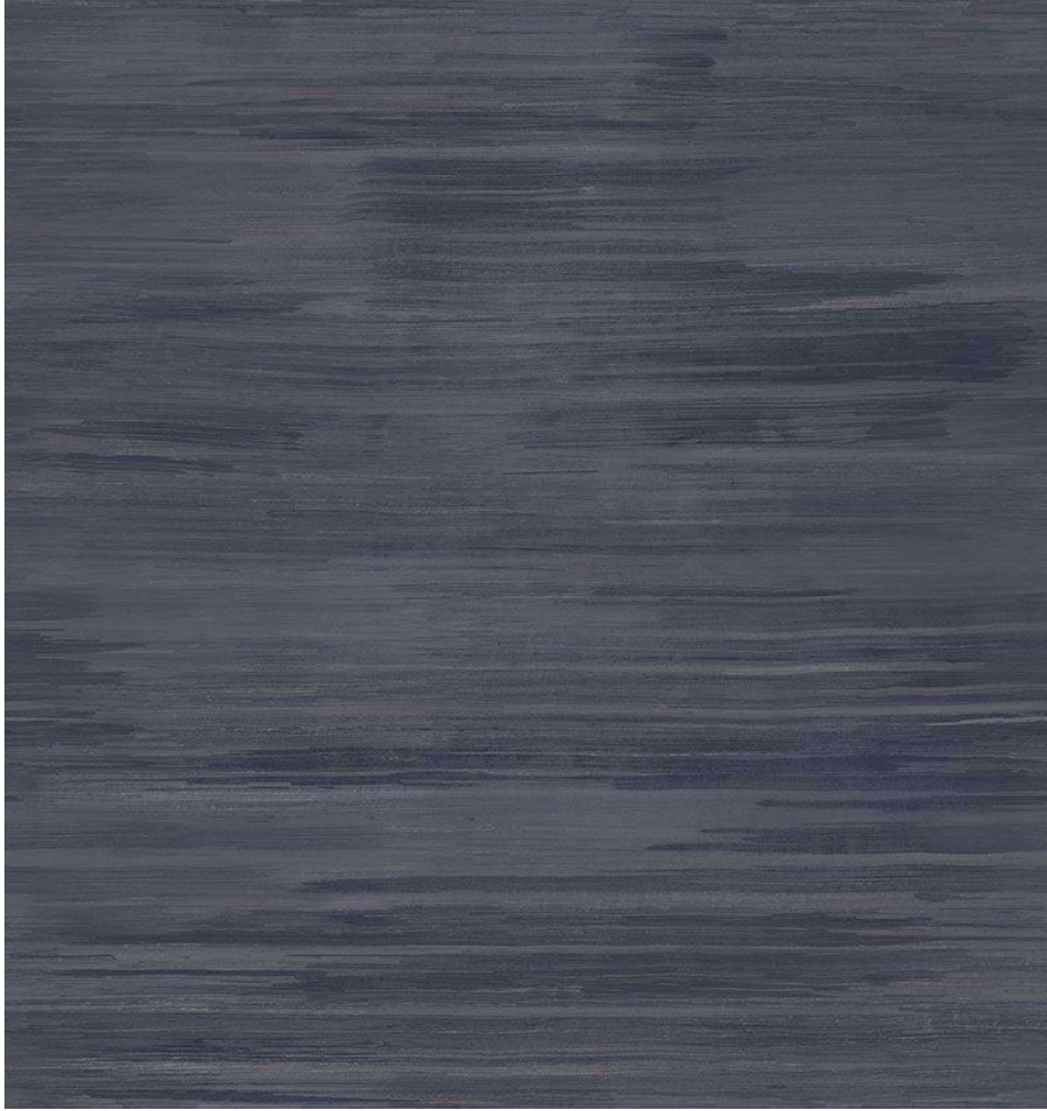
Hush Silk Cobalt Wallpaper