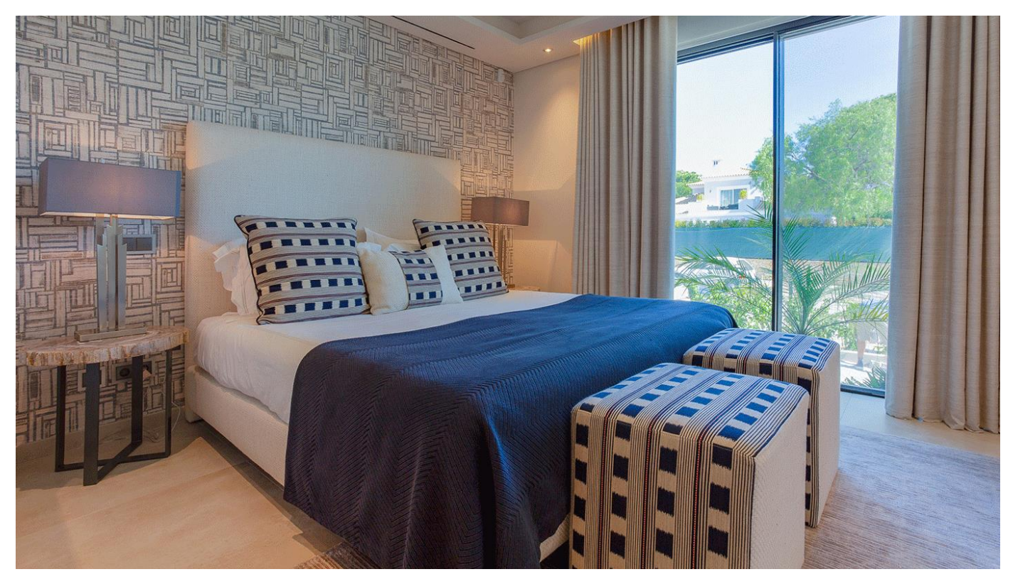
Gozo Cobalt Raffia wallpaper, Interiors by Melissa Jane Interiors