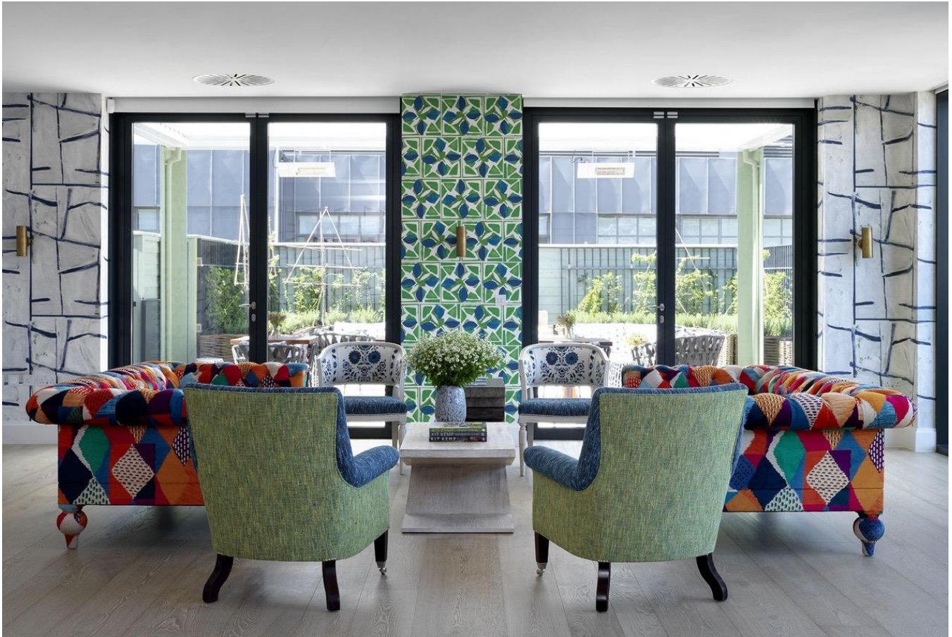
Fiori Grass Wallpaper in the Richmond Buildings by Firmdale Hotels