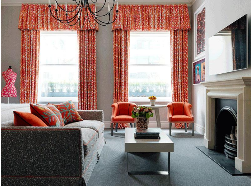
Fathom Hot Pink Curtains, Interiors by Firmdale Hotels