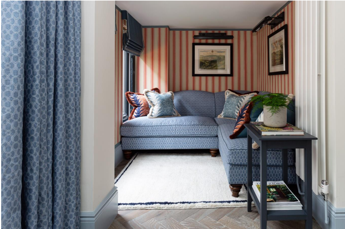
Chiselled Denim, Interiors by Henry Prideaux Interior Design