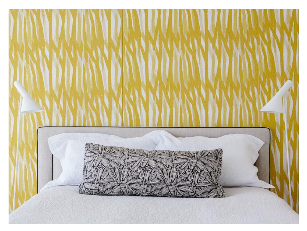
Breakwater Mimosa wallpaper, Interiors by Arent and Pyke