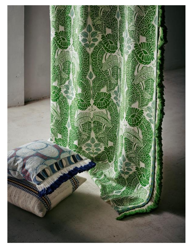
Belle-de-Nuit Green curtains with Ombre Fringe Trim