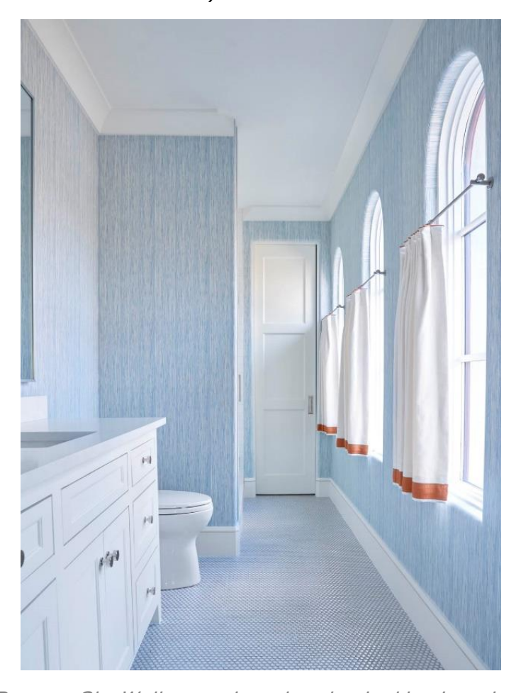
Downey Sky Wallpaper, Interiors by Jenkins Interiors